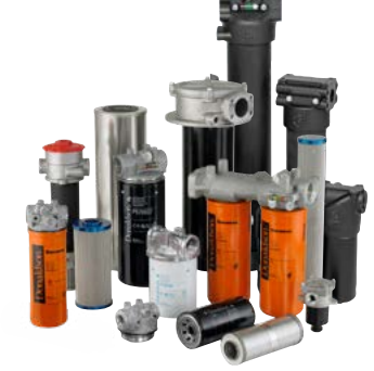
Low, medium and high pressure housings and filters. including Donaldson Duramax<sup>®</sup> to protect machinery and hydraulic components in hundreds of heavy-duty equipment applications.