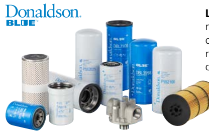
Lube filters capture metals, soot and contaminants to maintain higher cleanliness standards.

Donaldson lube filters keep oil clean by capturing contaminants that can cause engine damage.