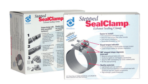
Stepped Preformed SealClamp is individually packaged with installation instructions.

Donaldson Australasia Pty Ltd PO Box 153, Wyong NSW 2259