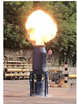
Full-scale testing of the Sealed Drum Kit.

Full-scale testing of the SDK showed it contains flames or sparks from the connection between a properly vented dust collector hopper and the attached drum. When applied in conjunction with effective dust collector explosion protection strategies, including explosion venting or suppression, the Donaldson Torit SDK may be an option for your combustible dust strategy. Consult appropriate standards and experts for further details and considerations.