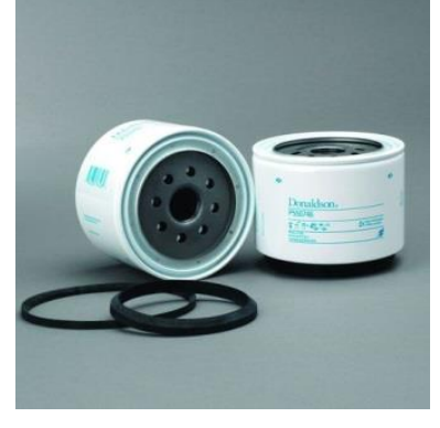
P550746 MICRON RATING: ○ S: 2 MICRON ○ T: 10 MICRON ○ P: 30 MICRON